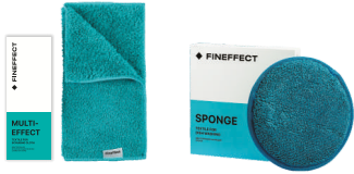
Wipe Multi-effect Sponge