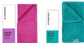
Wipe Superfiber Wipe Multi-effect