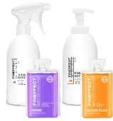
Home Gloss Plus