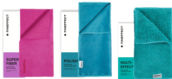
Wipe Superfiber Wipe Polish Wipe Multi-effect