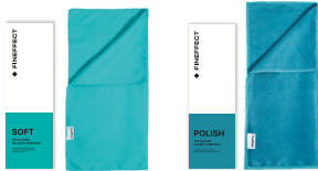
Wipe Soft Wipe Polish