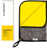
Wipe Universal Plus