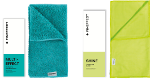
Wipe Multi-effect Wipe Shine