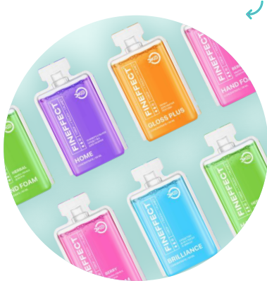
Household chemicals concentrates