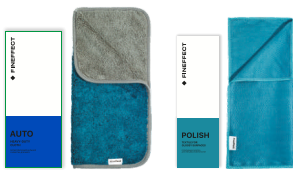
Wipe Auto Wipe Polish