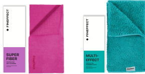
Wipe Superfiber Wipe Multi-effect