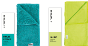
Wipe Multi-effect Wipe Shine