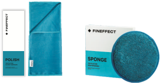
Wipe Polish Sponge