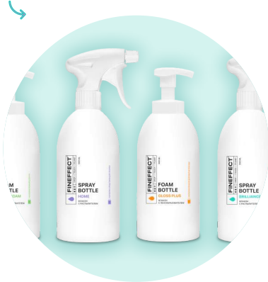
Reusable vials for each concentrate