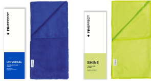
Wipe Universal Wipe Shine