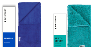
Wipe Universal Wipe Multi-effect